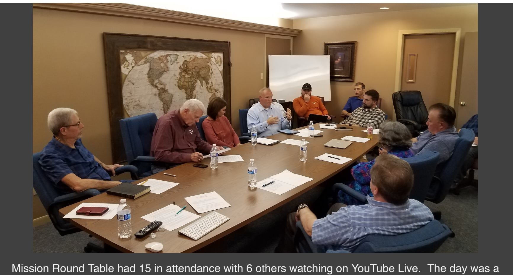
great success as we discussed healthy Acts 1:8 missions.